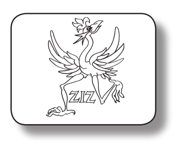
ZIZ – King of the birds, an enormous bird whose head touches the sky while its feet rest on the ground, its wings eclipse the sun and protect the earth from wind storms."